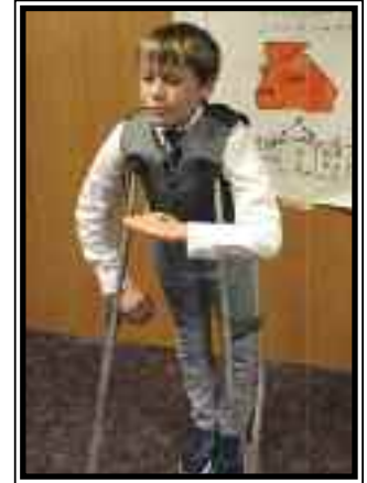
Franklin D. Roosevelt

5th Graders came alive as famous people from History who impacted the world during the Living Museum. Many famous familiar people such as Abraham Lincoln and Sacagawea told their story to other St. John's Students and parents. New faces such as Steve Jobs, Princess Diana and Elvis Presley joined the line up this year!