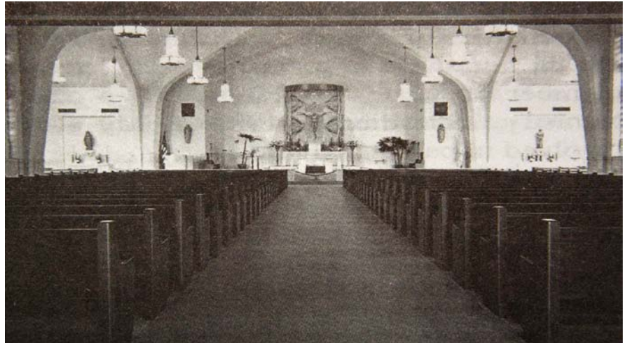
Church interior, 1981

By this time, Lyceum Hall was no longer usable, so the old church became the church hall.