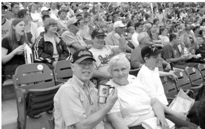
Dad's Club members and families enjoy a evening ball game at the new Eastlake Stadium built for the Lake County Captains

Come to the Garden alone while the dew is still on the roses