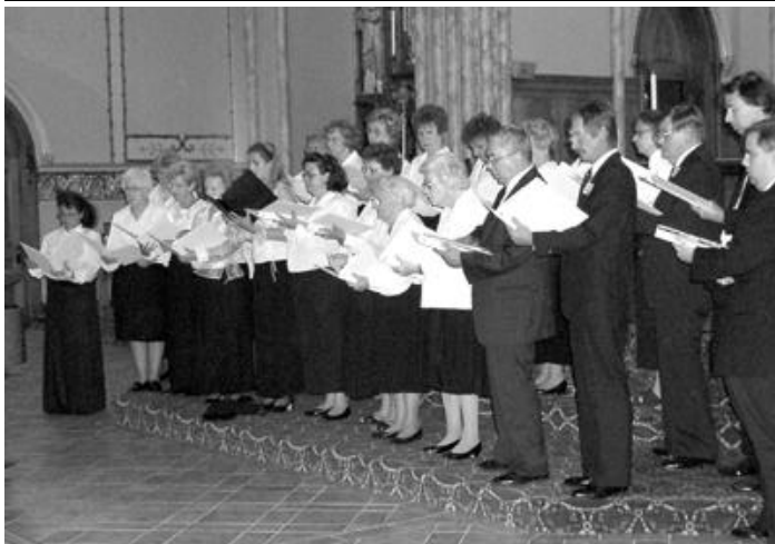
The Polish Singers Alliance of America (PSAA) District IX from Buffalo NY. Along with the St. Stanislaus combined choirs gave a magnificent performance at our Church last Sunday, celebrating the birthday of St. Stanislaus, bishop and martyr, Patron Saint of Poland.