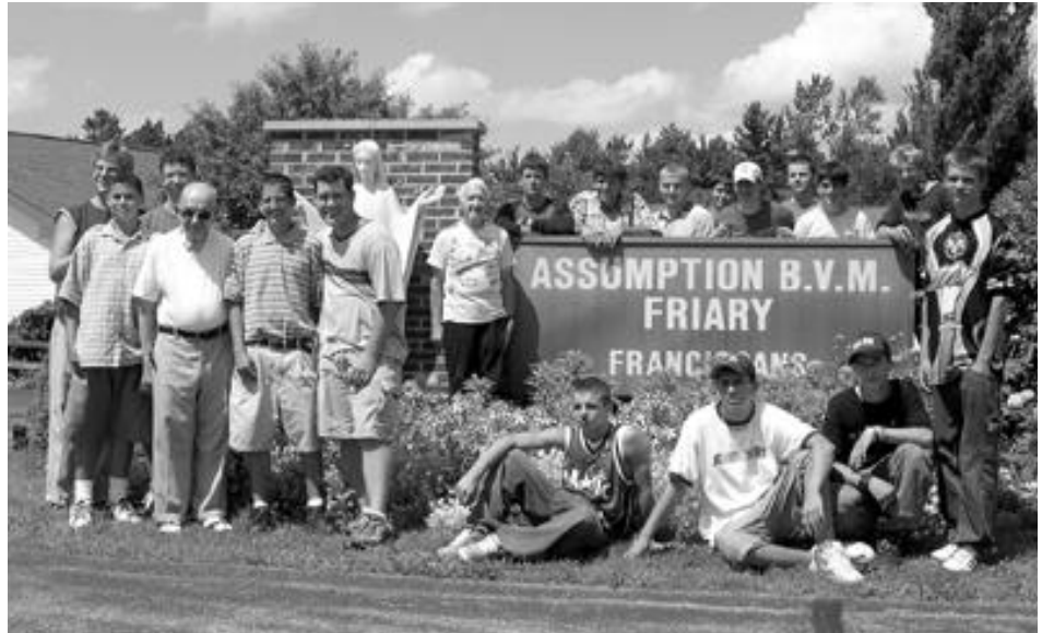
Lil Bros Club of St. Stanislaus enjoying a week as guests of the Franciscans!

The Polish Army Veterans, General Sikorski Post 203 will be selling flowers in front of church at all Masses this weekend, August 2-3. The proceeds of the flower sale go for the benefit of disabled veterans.