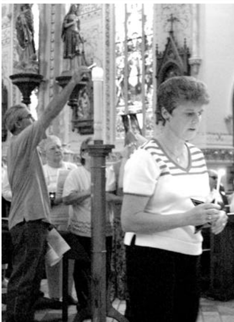
The Taizé Prayer Service of hope and Reconciliation Commemorating the Second Anniversary of Sept 11, was a very moving experience for the approximately 100 people who attended. Candles were lit by all participants in memory of the victims.