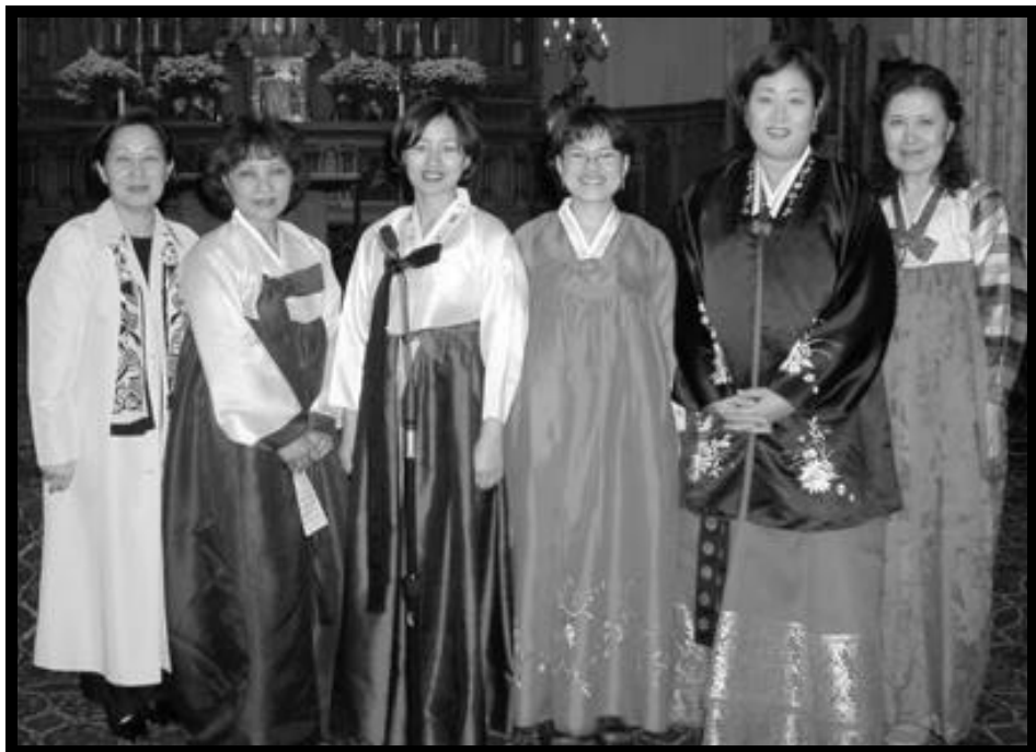
KOREAN CHOIR FROM ST. ANDREW KIM CHURCH

The St. Stanislaus Web site "www.ststanislaus.org" has been updated with a new look. We hope you will like the change and find it a bit easier to navigate. Since the June update, we have had almost 7,000 visitors who made almost 18,000 web page visits! Visit the photo album link to see photos of our Polish Festival and other parish activities.