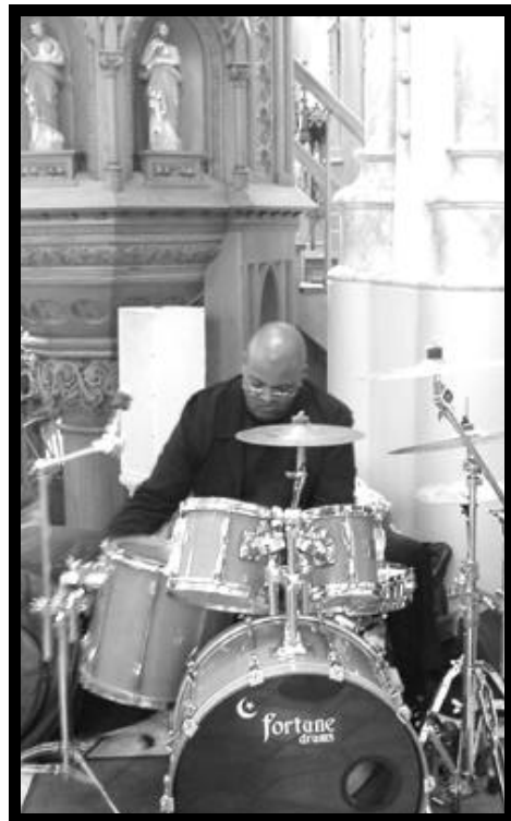
MUSICIAN FROM ST. AGNES/OUR LADY OF FATIMA CHURCH

Are you a new parishioner who wants to meet new faces and learn more about St. Stanislaus? Interested in learning more about your church and what it can offer you? The Evangelization Commission welcomes you to a meeting of welcoming Wednesday, November 5 at 7:00PM in the school all-purpose room. See new and old faces, learn about the history of your church, and hear about the many parish organizations that want to enrich your experience at St. Stanislaus. Snacks, beverages and childcare will be provided. For more information, please call the rectory.