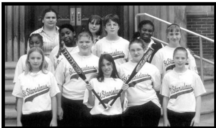
CYO GIRLS CADET SOFTBALL TEAM

Next year will see a wonderful new innovation in kindergarten education at Saint Stanislaus! The third floor "band room" in the Social Center will be renovated to become a new "Kindergarten Center," which will be able to accommodate more students and keep them in one building for meals and gym. If enrollment is large enough, it will be team taught with two teachers sharing the duties. Tell your friends with young children all about the new things happening at "Saints!"