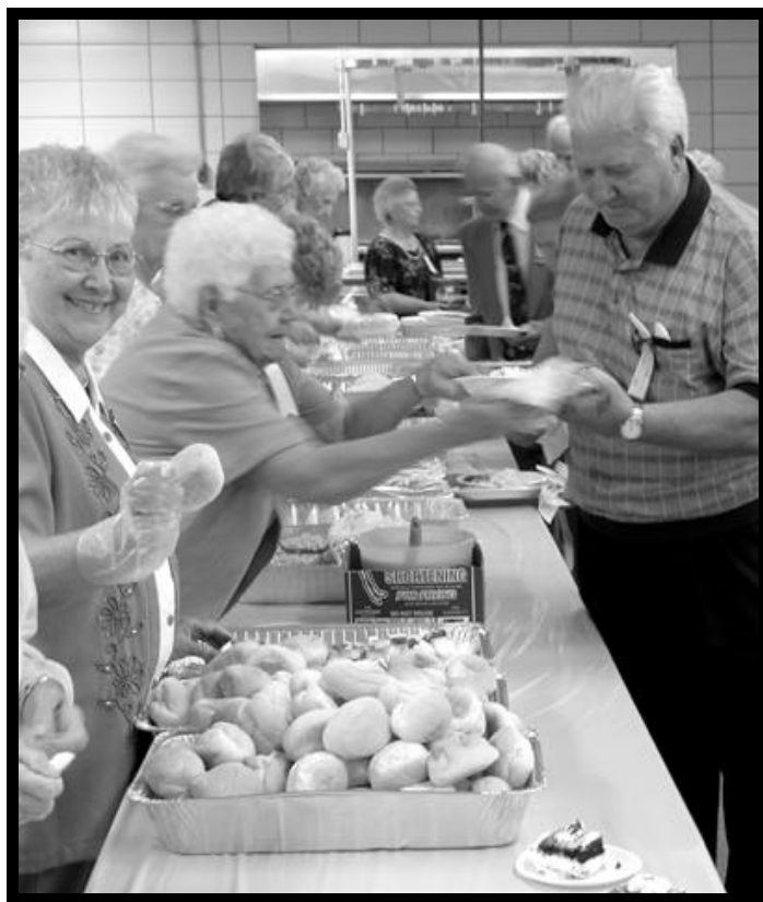
SERVICE WITH A SMILE at last weeks Golden Agers 38th Anniversary Dinner. Delicious food , good music and everyone had a grand time!