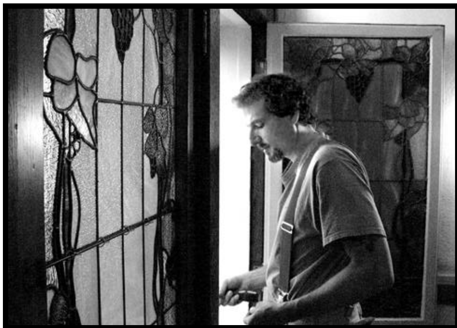
Getting Closer to Completion! A carpenter installs the restored stained glass windows in the stairwell to the Rectory's second floor.

Zgodnie z przyjętą w naszej parafii tradycją Dzień Eucharystii przeżywamy co roku w ostatnia niedzielę przed Adwentem - w Uroczystość Chrystusa Króla. Podobnie i w tym roku czcimy Chrystusa w Najświętszym Sakramencie w ostatnia niedzielę roku kościelnego czyli 21 listopada. Nabozenstwo rozpocznie się wystawieniem Najświętszego Sakramentu do prywatnej adoracji bezpośrednio po Mszy św. o godz. 11:30. Zas o godz. 4:00 po południu będzie nabozenstwo końcowe ze wspólnotową adoracją, które zakończymy uroczystą procesją i błogosławieństwem Najświętszym Sakramentem. W tym roku nasze uroczystości będą miały szczególny charakter, gdyż w nabozenstwo włączone będzie poświęcenie odrestaurowanej plebanii. Prace renowacyjne dobiegają końca. W najbliższą sobotę, 13 listopada, nastąpi uroczyste przecięcie wstęgi i otwarcie budynku, zaś w czasie nabozenstwa Eucharystycznego w Uroczystość Chrystusa Króla plebania zostanie pobłogosławiona, aby od tego momentu znowu służyła parafii zgodnie ze swoim przeznaczeniem.