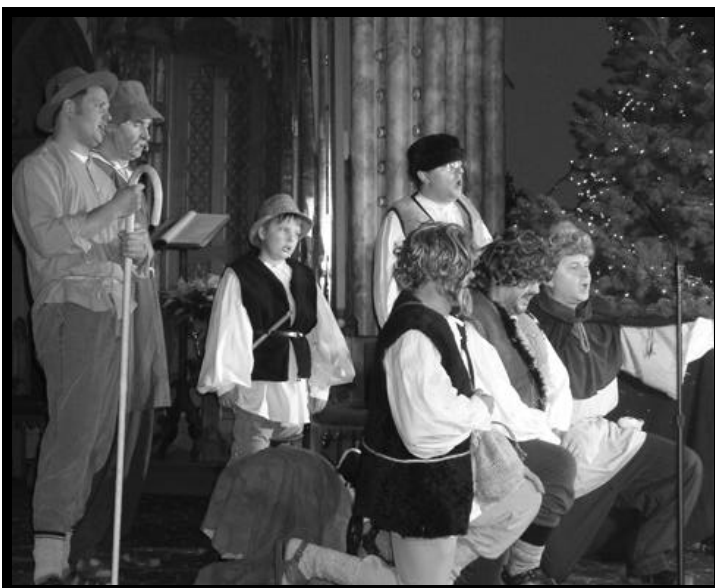
Scenes from PASTORALKA STAROPOLSKA presented at St. Stanislaus on Jan 2 by the Opera Circle and Friends from the Choirs of St. Stanislaus and Immaculate Heart of Mary Parishes.