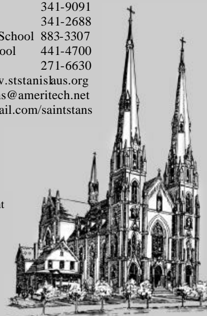
The artist's sketch on the right depicts the original building with the spires. Corner Stone laid in 1886, and church dedicated in 1891.

PHOTO ALBUM www.picturetrail.com/saintstans