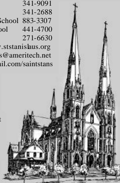
The artist's sketch on the right depicts the original building with the spires. Corner Stone laid in 1886, and church dedicated in 1891.

PHOTO ALBUM www.picturetrail.com/saintstans