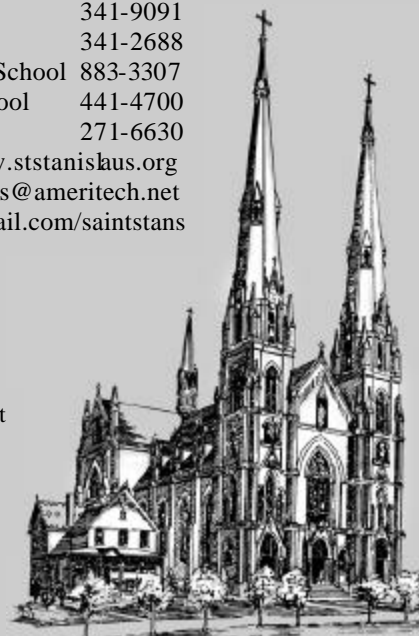
The artist's sketch on the right depicts the original building with the spires. Corner Stone laid in 1886, and church dedicated in 1891.

PHOTO ALBUM www.picturetrail.com/saintstans