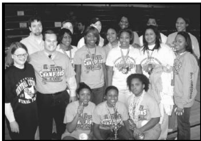
The Cleveland Central Catholic H.S. Girls Basketball team has brought the school its first State Championship ever! The team won the Div. III trophy with a 51 to 45 victory against Delphos St. John's in Columbus on Saturday, Mar 17. Thank you for an exciting season!