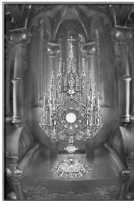
St. Stanislaw Church, Cleveland, Oh. Monstrance

The burning bush consumes the altar/cross with love. So, what are you looking at?