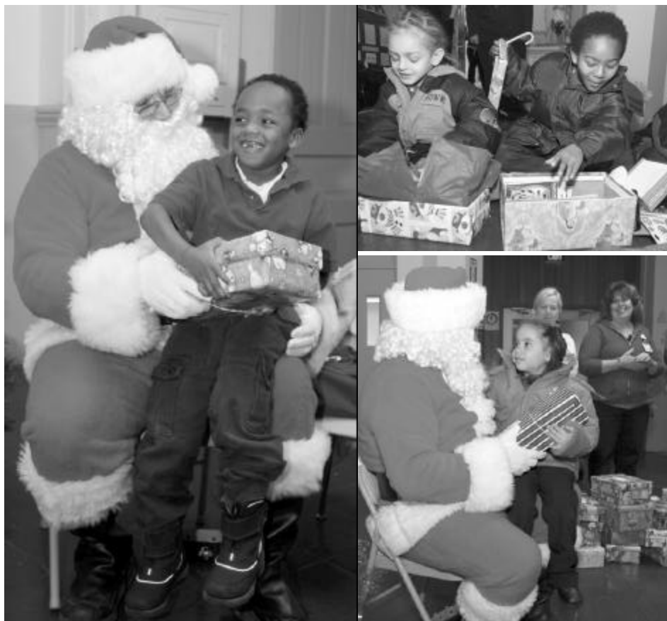
St. Stanislaus School Children must have been very good, because Santa made a special visit to them on Wednesday Dec 19, and distributed presents.

CDs, Tapes, Religious Items, Books, Pictures and much much more! New Stock Added!