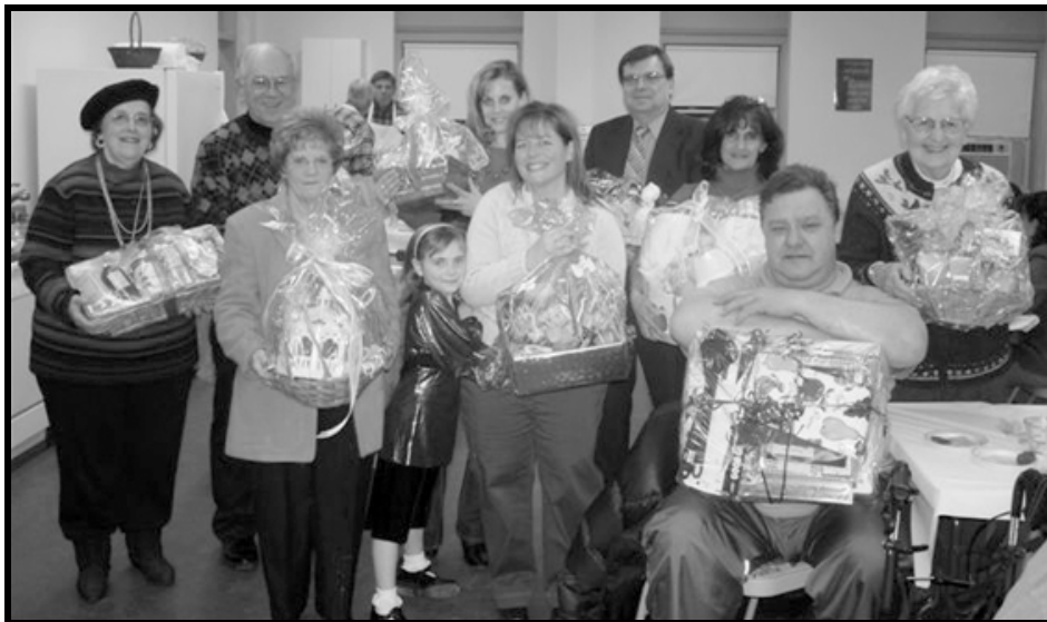
HAPPY PRIZE WINNERS POSE AFTER THE ALUMNI REUNION TWO WEEKS AGO