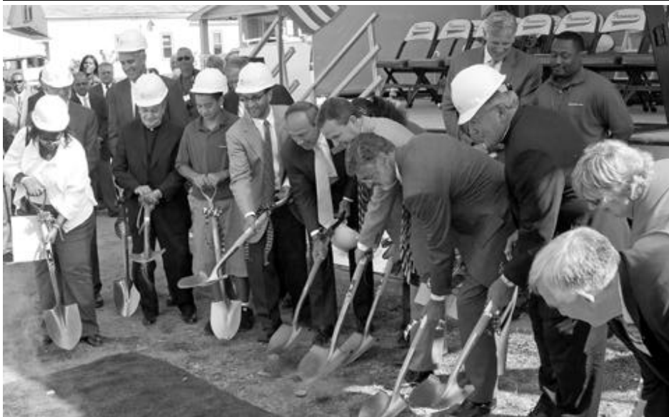
Cleveland Central Catholic High School breaks ground for a new football and sports field. A project that has been in the works for a number of years is finally coming to fruition. Opening of the new facility is scheduled for the spring of 2009.