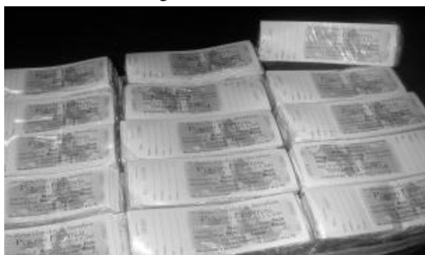
The winning ticket is somewhere in this box!!! Will your name be on it????