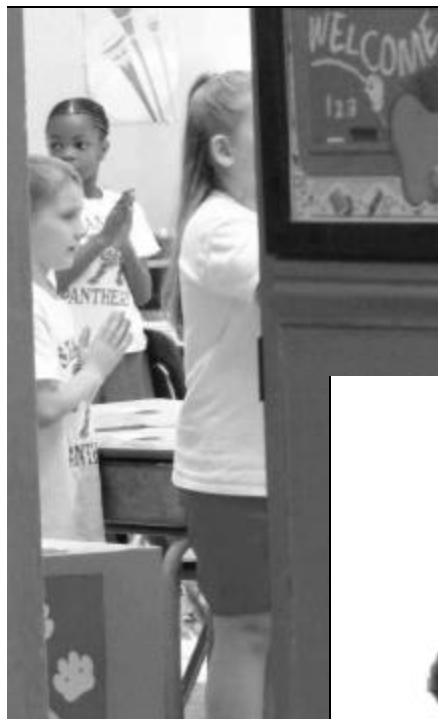
Prayer four times a day. This is the normal routine at Saint Stanislaus School. The first thing of the day, on the first day of school, these Second Grade students remember that God is at the center of everything.