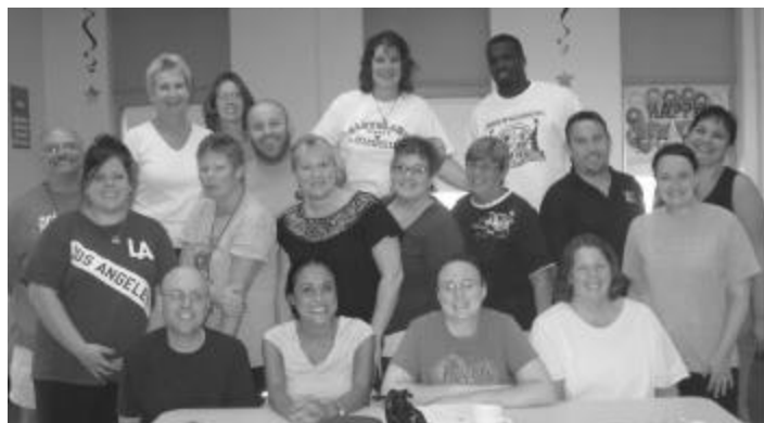
Ready for the new school year? The staff of our grade school certainly is. Look at those smiling faces as they finish the last day of meetings before the students arrive.

Specific area you would like to volunteer: