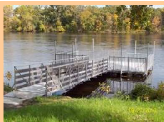
Where can you go fishing in Sartell? Rotary Park on the Mississippi River!