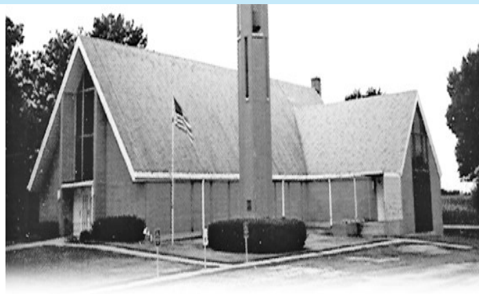
St. Joseph—East Pleasant Plain, Iowa 1174 Reed Ave

Parish Office: PO Box 37, Brighton, Iowa 52540 Phone: 319-694-3672 E-Mail: mcsjrich@windstream.net Parish Website: ssjosephandcabiniparish.weconnect.com