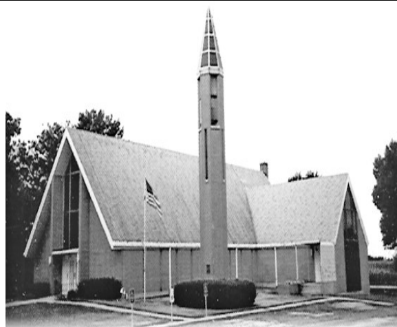
St. Joseph—1174 Reed St., East Pleasant Plain, Iowa

Parish Office/Mailing Address: PO Box 37, Brighton, Iowa 52540