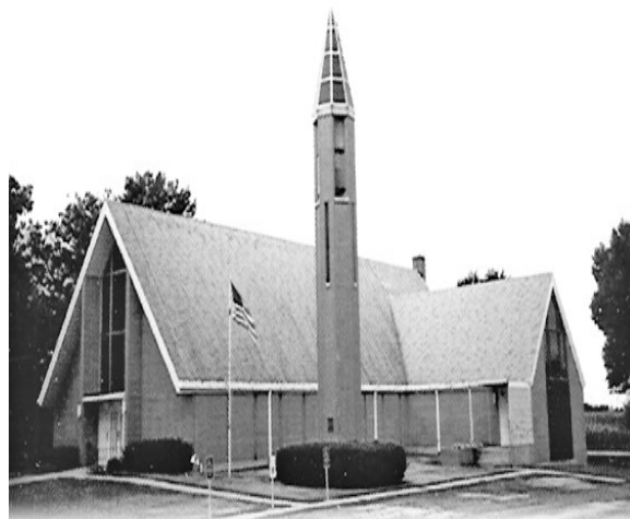
St. Joseph—1174 Reed St., East Pleasant Plain, Iowa

Parish Office/Mailing Address: PO Box 37, Brighton, Iowa 52540