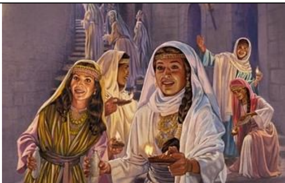
The Thirty-Second Sunday in Ordinary Time

We also have various groups from our community making use of our facilities. We are able to create some revenue by charging for these groups to use the cafeteria, gym, and field. One such group is the Cecil County Grand Jury, who is using our gym for extra space in order to follow COVID restrictions. Should you see police vehicles parked around the building, do not be alarmed.