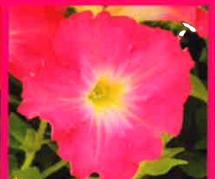
ROSE DAWN WAVE®