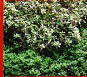
THYME ☀️ JUNE-AUGUST * FULL SUN / PART SHADE