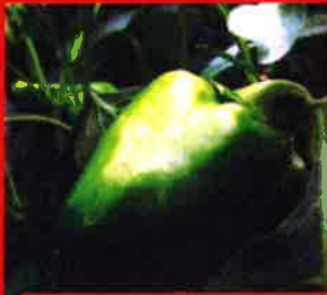
BELL PEPPER ☀️ AUGUST * FULL SUN / PART SHADE