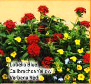
Lobelia Blue Calibrachoa Yellow Verbena Red

Color Bowls are 11" by 4" and fit snugly into a 12" or larger patio container.