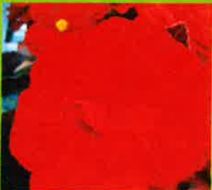
RED BEGONIA ☼ JUNE-FROST ☼ PART SHADE / SHADE