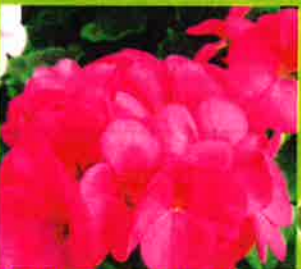
PINK GERANIUM + VINCA ☼ FREELY ☼ FULL SUN / PART SHADE