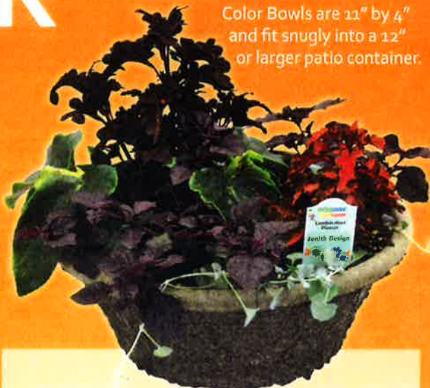
ZENITH DESIGN ☼ JUNE-FROST ☼ PART SHADE / SHADE