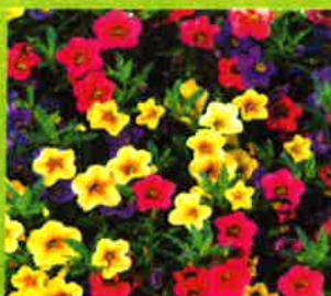
PRIMARY PALETTE MIX ☼ JUNE-FROST ☼ FULL SUN / PART SHADE