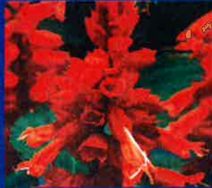
RED SALVIA ☀️ MAY-SEPTEMBER * FULL SUN