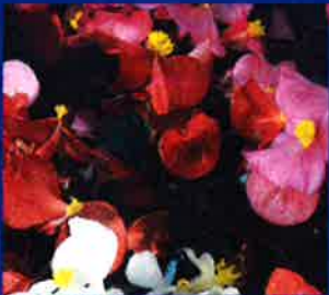
BEGONIA (BRONZE-LEAF) MIX ☀️ JUNE-FROST * SHADE