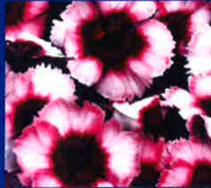
RASPBERRY DIANTHUS ☀️ APRIL-FROST * FULL SUN / PART SHADE