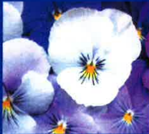
BLUE CHILL PANSY ☀️ MAY-JUNE * FULL SUN / PART SHADE