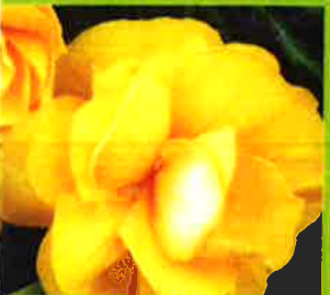
YELLOW BEGONIA ☼ JUNE-FROST ☼ PART SHADE / SHADE