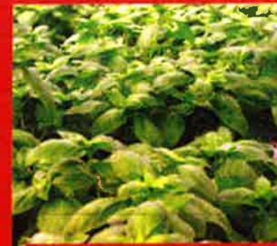
SWEET BASIL ☀️ JUNE-AUGUST * FULL SUN / PART SHADE