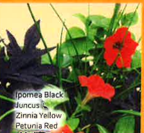
Ipomea Black Juncus Zinnia Yellow Petunia Red