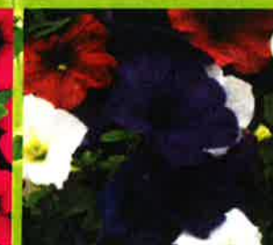
RWB PETUNIA MIX ☼ MAY-FROST ☼ FULL SUN / PART SHADE