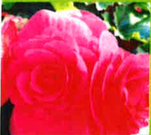
ROSE BEGONIA ☼ JUNE-FROST ☼ PART SHADE / SHADE