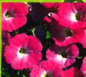
PINK PETUNIA ☼ MAY-FROST ☼ FULL SUN / PART SHADE