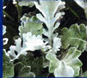
DUSTY MILLER ☀️ JUNE-FROST * FULL SUN / PART SHADE