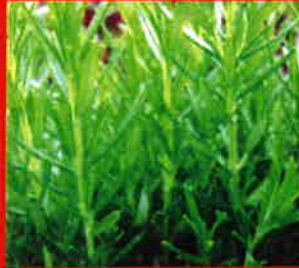
ROSEMARY ☀️ JUNE-AUGUST * FULL SUN / PART SHADE