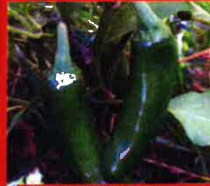
JALAPENO PEPPER ☀️ AUGUST * FULL SUN / PART SHADE