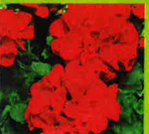
RED GERANIUM + VINCA ☼ FREELY ☼ FULL SUN / PART SHADE