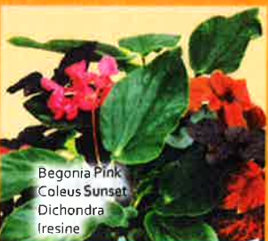
Begonia Pink Coleus Sunset Dichondra Iresine