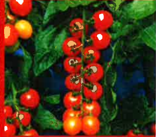
CHERRY TOMATO ☀️ AUGUST * FULL SUN / PART SHADE