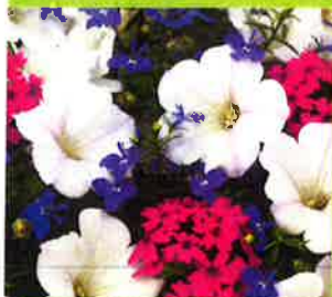
EVENING DELIGHT MIX ☼ JUNE-FROST ☼ FULL SUN / PART SHADE

They are beautiful, last longer than cut flowers, and are a great way to kick off the gardening season.