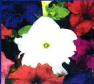
PETUNIA MIX ☀️ MAY-FROST * FULL SUN / PART SHADE