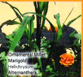
Ornamental Millet Marigold Helichrysum Alternanthera