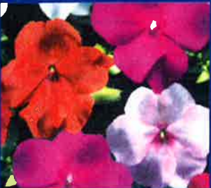
IMPATIENS MIX ☀️ JUNE-FROST * SHADE / PART SHADE