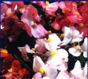
BEGONIA (GREEN-LEAF) MIX ☀️ JUNE-FROST * SHADE