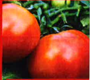
TOMATO ☀️ AUGUST * FULL SUN / PART SHADE