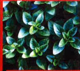
OREGANO ☀️ JUNE-AUGUST * FULL SUN / PART SHADE