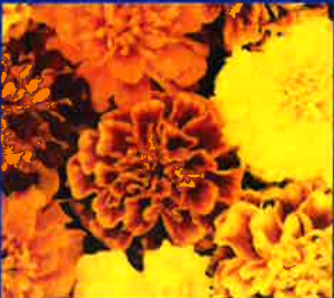
MARIGOLD MIX ☀️ JUNE-FROST * FULL SUN