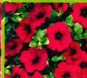
PURPLE PETUNIA ☼ MAY-FROST ☼ FULL SUN / PART SHADE