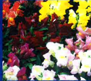
SNAPDRAGON MIX ☀️ APRIL-FROST * PART SHADE