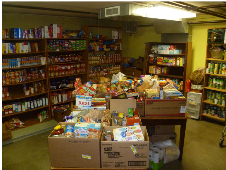
Our Lady of Victory Food Pantry - March 2015

The Delhi firemen were once again on hand to carry the Easter boxes to cars. We cannot do this on our own. All the food pantry workers and carriers deserve a big thank you. They are a blessing to our Church.