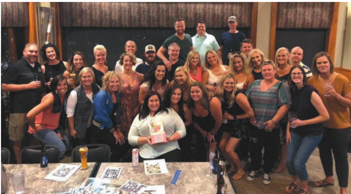
Above: OLV Class of 1994 - 25th Reunion