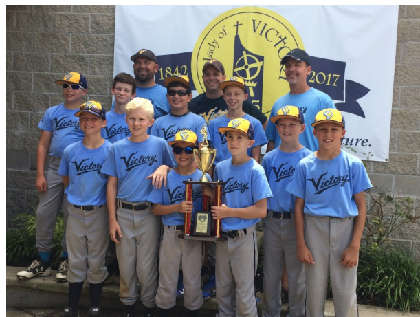
The 11U National Davis team CWBC Runner ups.