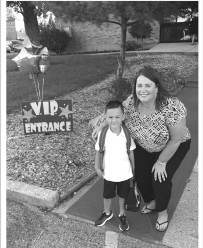
Welcoming back the students At Our Lady of in style with a VIP Entrance! Victory, we are