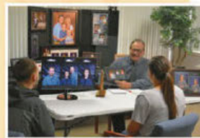
Nuevo vidrio de seguridad en la estación de visualización