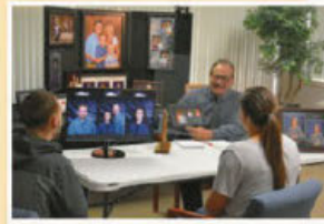
Nuevo vidrio de seguridad en la estación de visualización