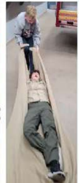
Two-Handel Blanket Carry

Since October is Fire Prevention Month, scouts also discussed fire safety. Everyone had a great