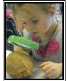
Harper examines a coconut during a science experiment.

the word and drew the item they 'constructed' from the blocks. As we wait for warmer days to approach, we continue to work on math concepts and language; sequencing, addition and subtraction, opposites, letter recognition and phonics, rhyming, and conversation skills and etiquette.