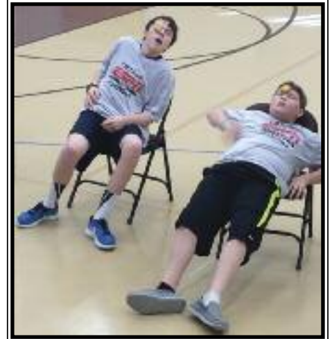
Minute To Win It