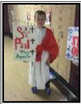
Saints Day projects

dents did an amazing job sharing the lives of these important people of faith. We have also spent a lot of time reading many different types of books this year. Each month the students choose a book to read and share with the class. The students have also been studying the United States and their own state, North Dakota, this year. After learning about their own state, we will celebrate with a trip to Bismarck to tour many of the amazing places we've learned about.