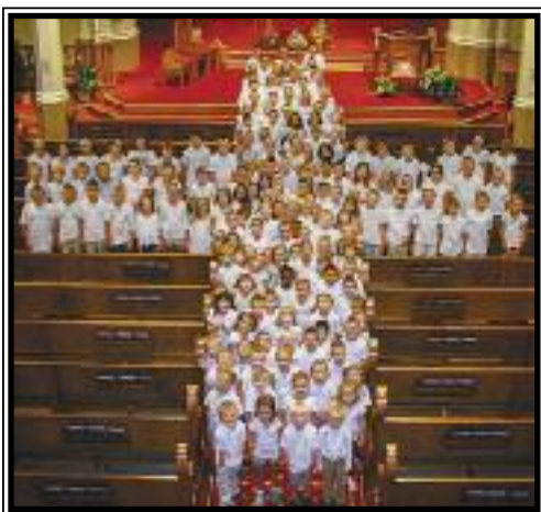
THANK YOU from the bottom of our hearts for your support!

A HEARTFELT THANK YOU to all of you who so generously helped make our Giving Hearts Day a huge success. With your generous donations we have raised over $25,000 for St. John's Academy. We had a lot of fun as we shared the "GoMatchy Matchy" theme and dressed alike and challenged others to make a gift too! We even won an award for Giving Hearts Day, the "Rising Star Award" another $500 for St. John's Academy and a donation from Bell State Bank of $250.