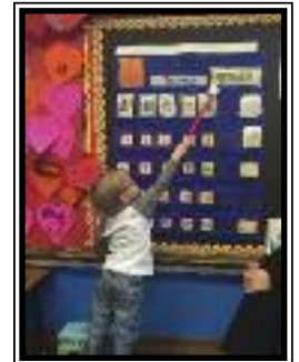
Treyson leads circle time.