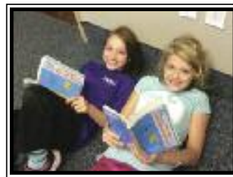
Reading Tales of a Fourth Grade Nothing and completing activities.

We have been busy in fourth grade this year. We began with our annual tradition of celebrating All Saints Day. Each student chose a saint special to them, researched that individual, and created a costume to represent him/her. The stu-