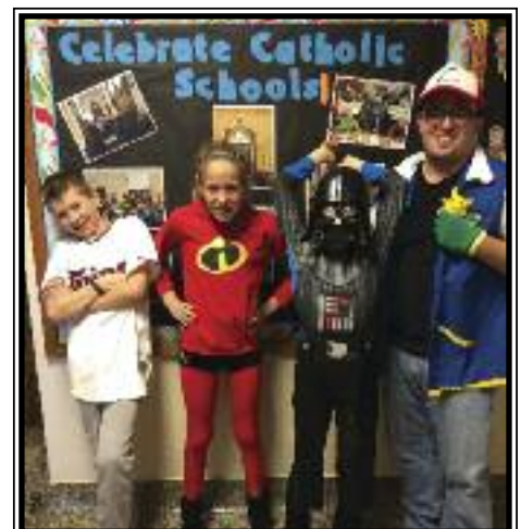
Super Hero Day