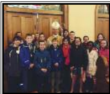
Fifth graders stop to pose for a picture with Bishop Folda during Catholic School Week!

Follow us on instagram @sja.ms.mutschler