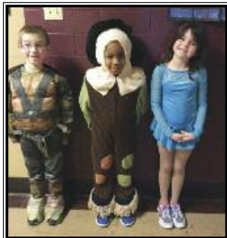
Super Hero Day