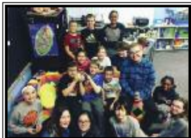
Fifth graders pose for a picture with our super cool super grumpy yet super cute class pet, Waffles the Hedge Hog!