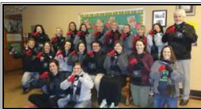
Left - Staff having fun with the "GoMatchy Matchy" theme for Giving Hearts Day.