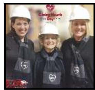
Right - Giving Hearts Day Committee! A heartfelt THANK YOU for your generous heart!