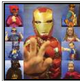
Kids K Super Hero Day.

Banging and pounding could be heard from the KK room as well with the opening of our Word Building Construction Company. Hard hats, tool