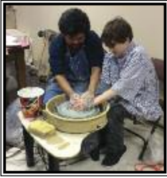
Using pottery wheel with Memo.

felt like to be discriminated against just because we were different. The end result: empathy, compassion, understanding.