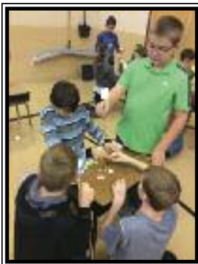
Fifth grade boys attempt to create the tallest structure using marshmallows and noodles during the school wide STEAM activity.