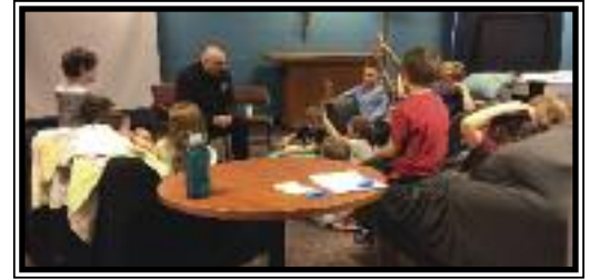
Msgr. teaching the Sacraments.