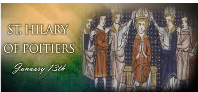
Bishop & Doctor of the Church

Heart of Jesus, I place my trust in you!