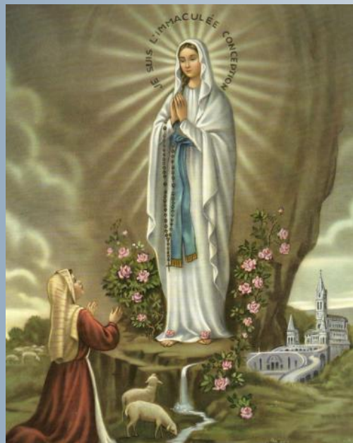
Our Lady of Lourdes – Pray for us!

On February 11, 1858 The Blessed Mother appeared to a young girl, Bernadette Soubirous age 14 in Lourdes, France.