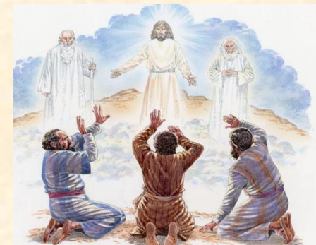
Transfiguration of the Lord

Edgemont Food Bank: Donate non-perishable food items by bringing them to the church building (main entrance doors). Thank you!