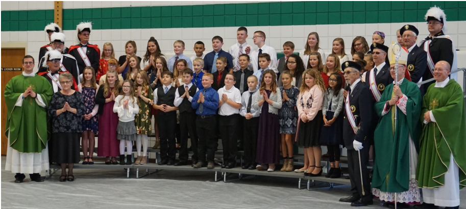
5th & 6th Grade Confirmation