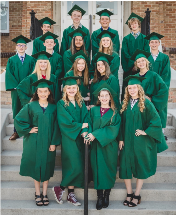
St. Patrick 8th Grade Graduates May 11, 2019