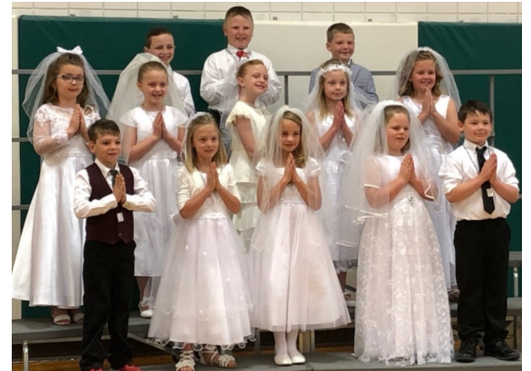
2nd Grade First Communion