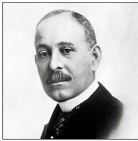
African American cardiologist who performed the first documented, successful pericardium surgery in the world

Daniel Hale Williams, (born January 18, 1858, in Hollidaysburg, Pennsylvania). He was an American physician and founder of Provident Hospital in Chicago, credited with the first successful heart surgery.