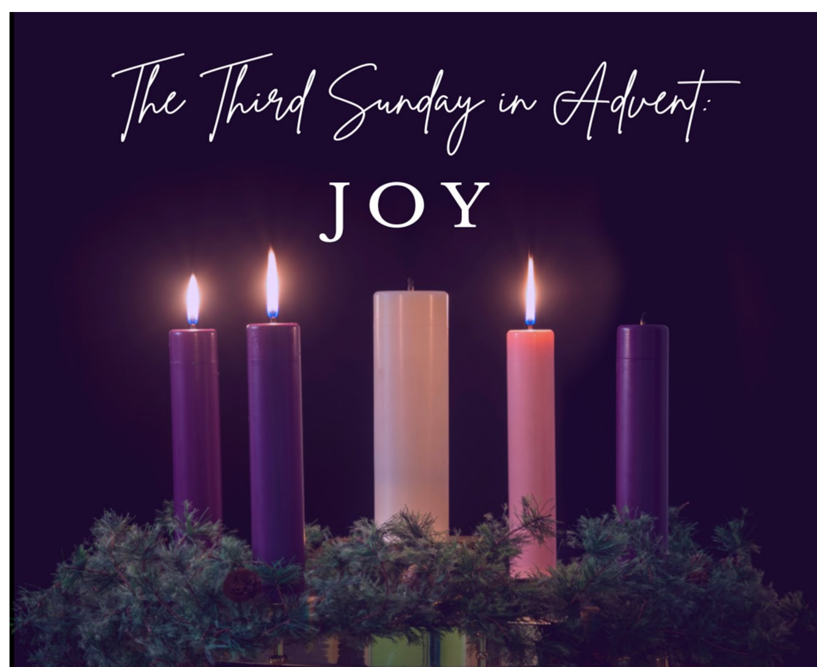
Third Sunday of Advent ~ December 14, 2025

Immaculate Conception Catholic Church 1565 Curtis Street - Baton Rouge, LA 70807 Office Phone: (225) 775-7067 - Information: (225) 775-7062 Fax: (225) 775-0775 - Email: clarktf2002@yahoo.com Web Site Address: www.immaculateconceptionbr.org Immaculate Conception Church is a Black Catholic Church serving the family of God and feeding the soul of the Community.