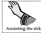
Anointing the sick

We will have a celebration of the Sacrament of the Anointing of the Sick on Sunday, March 31 at 4:00 PM. All those who are experiencing illness or weakness at this time are invited to celebrate this sacrament of healing and strengthening.