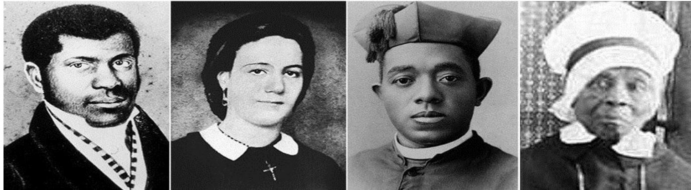
Venerable Pierre Toussaint