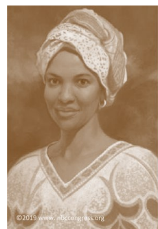
Servant of God Sister Thea Bowman