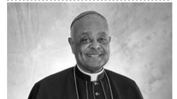
Pope Francis appoints America's first Black cardinal, Wilton Gregory. First Black U.S. prelate to earn the Red Hat. The ceremony will be held November 28th.

Forms for new parishioners or changes are located in the vestibule of the church.