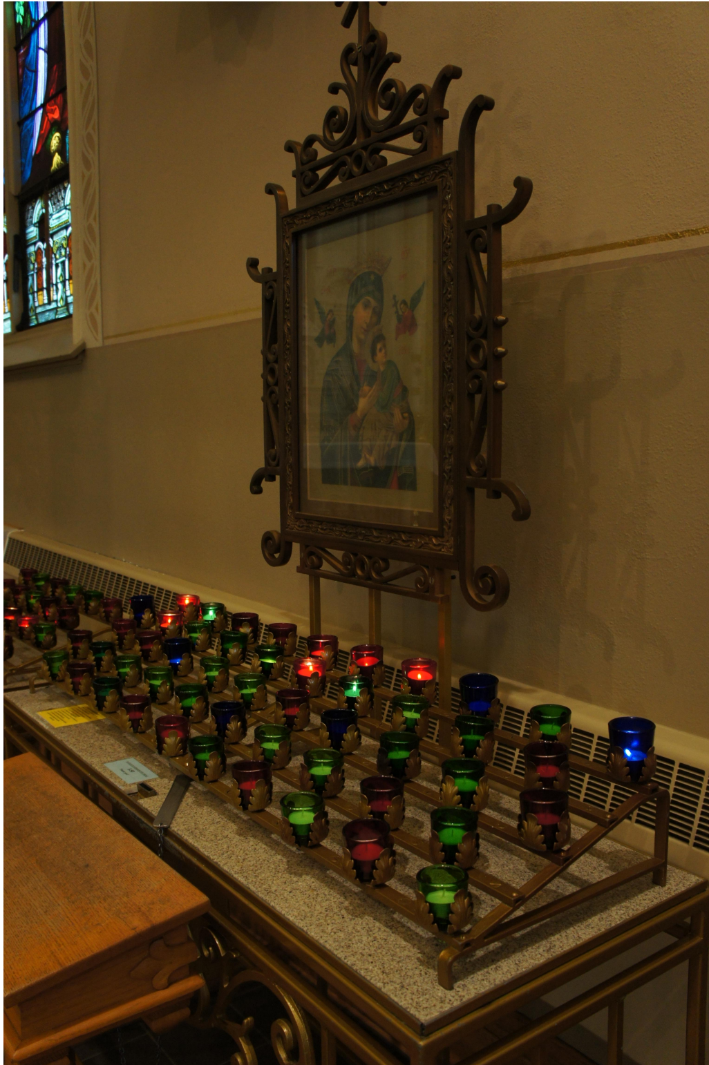
The shrine features a reproduction of an icon of Our Mother of Perpetual Help. The original icon was painted by an artist in Crete in the 14 th Century. It was eventually found in Rome and was venerated in the church of the Redemptorist Order. The icon