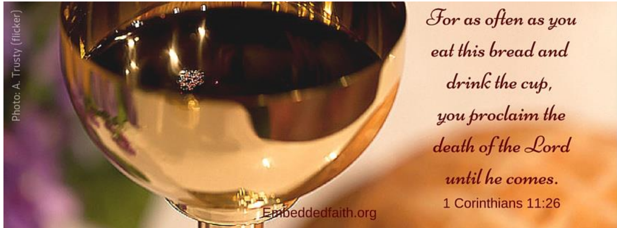
TABLE LITURGY FOR THE FEAST OF EASTER SUNDAY

I want to share with you a table liturgy for the feast of Easter Sunday that you and your family can pray as part of your family's celebration of the Resurrection of our Lord Jesus on Easter Sunday.