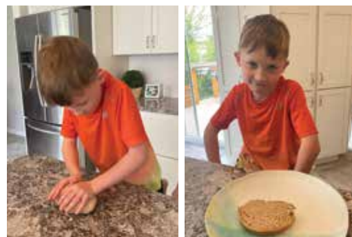
First Communicant making bread at home during the First Communion retreat last April.

Both Ignatian Prayer and Faith Sharing and the RCIA sessions primarily relied on Zoom to remain connected during the pandemic in the absence of in-person meetings. The former is a monthly gathering of 12-15 adults who pray by reflecting on the upcoming Sunday Mass readings in the context of their day-to-day lives. Mostly seniors, these individuals truly value the opportunity to regularly connect with and support one another. One woman commented on her experience: “I look forward to the communal experience of faith sharing each month. Recently, meditating on Sunday’s gospel about when Jesus was asleep in the boat and the apostles were afraid of the raging sea,