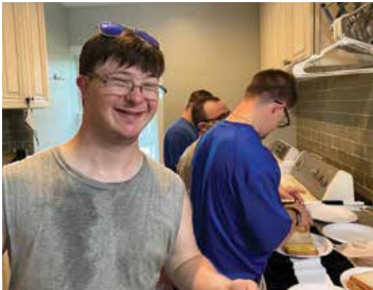
YA You CAN Ministry members making sandwiches for St. Pat's Hunger Center.

Gesu's YA You CAN Ministry is a program developed to meet a unique need in our Catholic Church. Various programs exist to further faith formation in adults, teens, engaged couples and 50+ parishioners in most parishes; however, few programs exist to further the spiritual life of young adults with special needs after they receive the Sacrament of Confirmation.