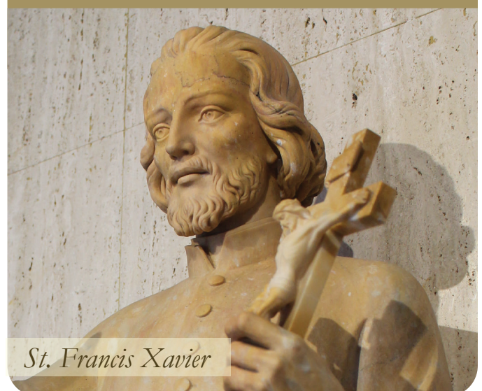
St. Francis Xavier