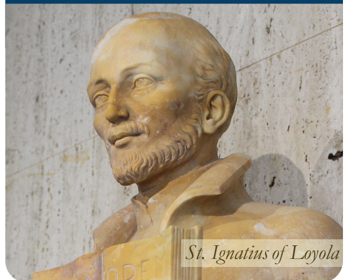
St. Ignatius of Loyola