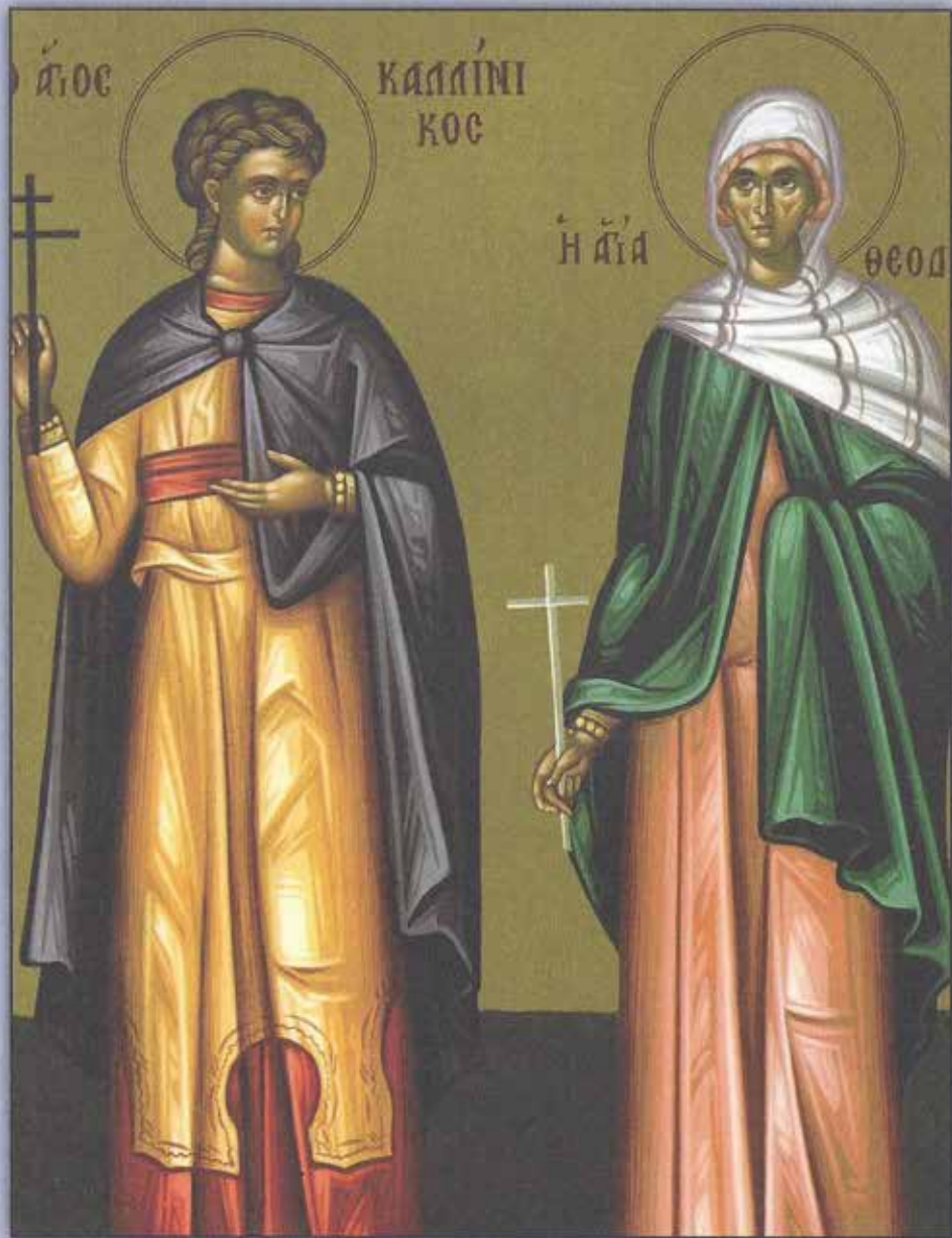
Icon of Saints Callinic and Theodotia -- July 29th