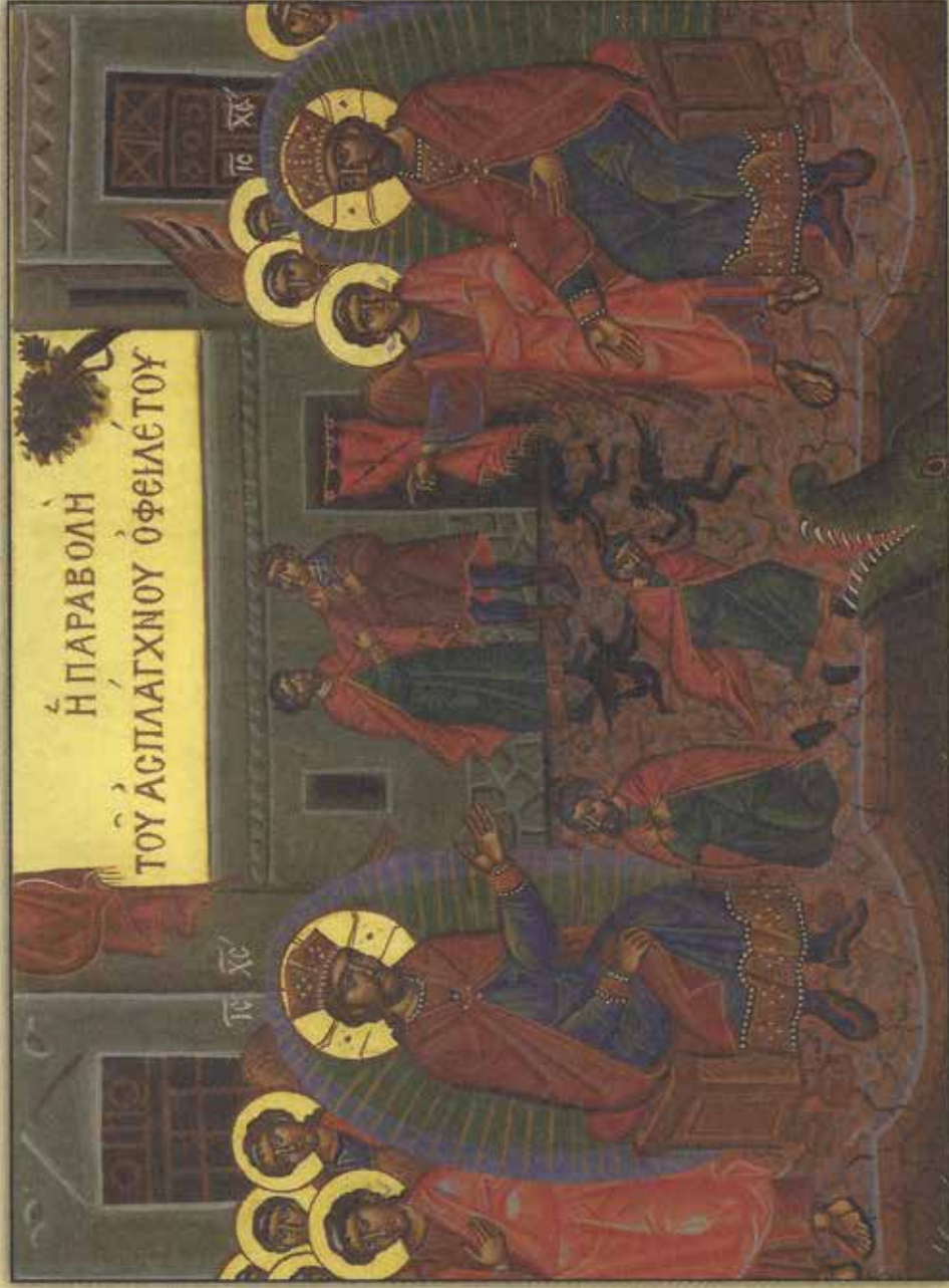
Icon of the Unmerciful Servant (Matthew 18:23-25)