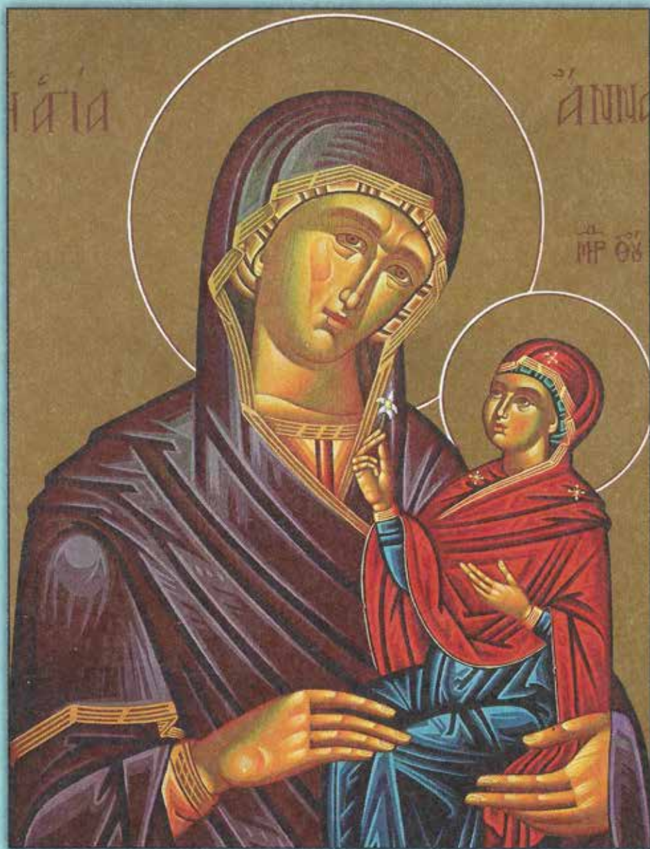
Icon of Saint Anna and Mary