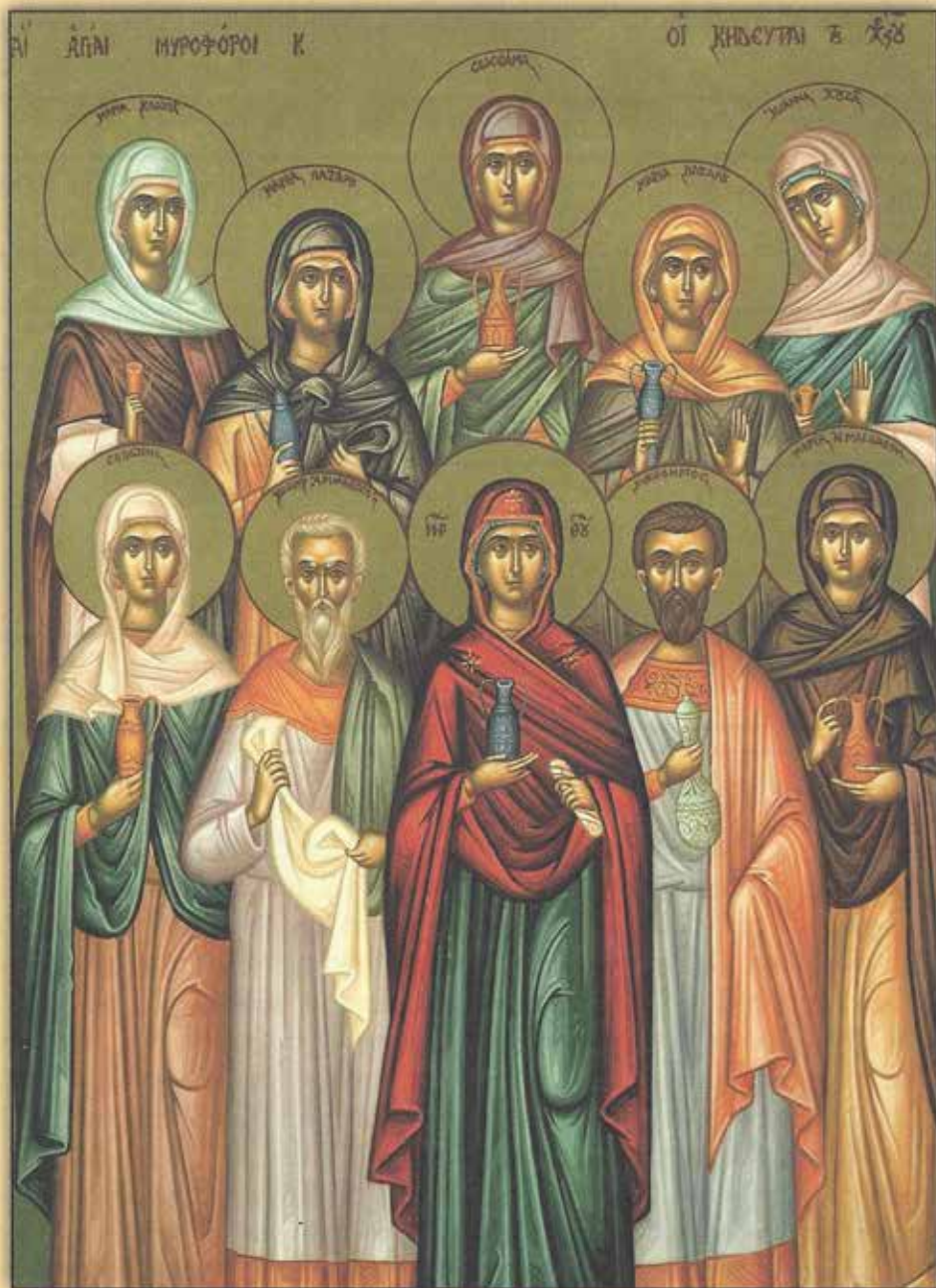
Icon of the Myrrh-bearing Women